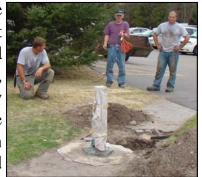
Preparations for construction have already begun as crew members worked to save the outdoor drinking fountain and transplant the trees